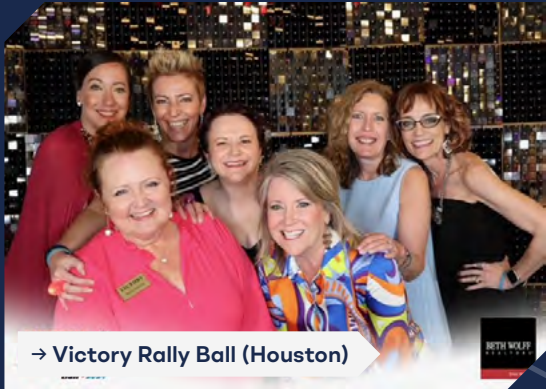
→ Victory Rally Ball (Houston)