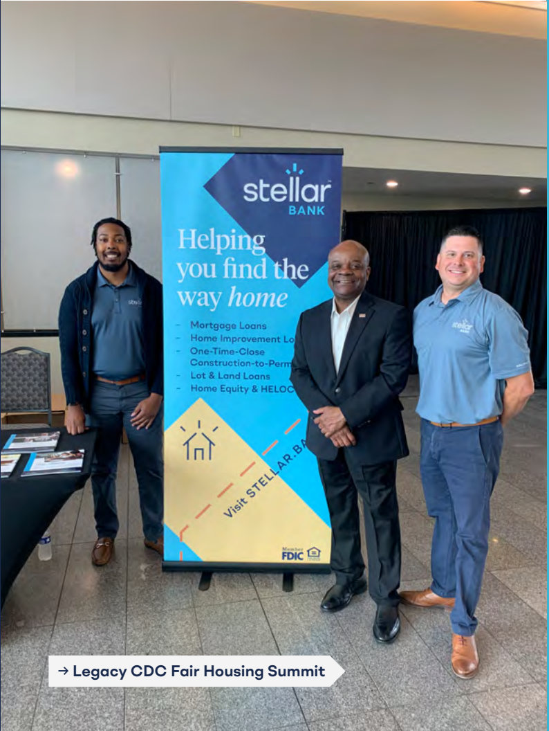
→ Legacy CDC Fair Housing Summit

“Stellar Bank is deeply committed to reinvesting in the communities we serve through lending, investing, and services that promote development in low-to-moderate income (LMI) areas. Through this work, we are helping to build communities that thrive.”