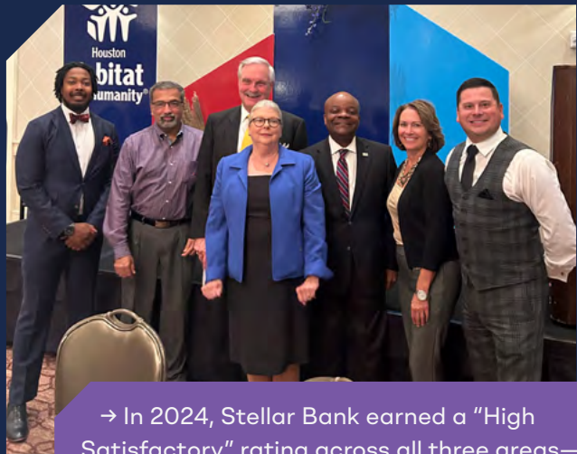
→ In 2024, Stellar Bank earned a "High Satisfactory" rating across all three areas—Lending, Investments, and Services—during our CRA Performance Evaluation. The Bank was recognized as a leader in community development lending, originating 104 community development loans totaling $336 million during the review period.