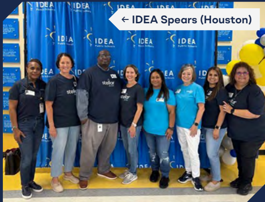
← IDEA Spears (Houston)