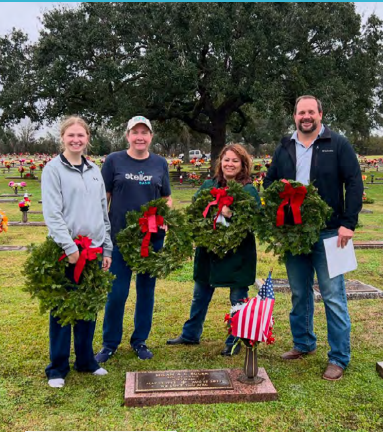
→ Wreaths Across America