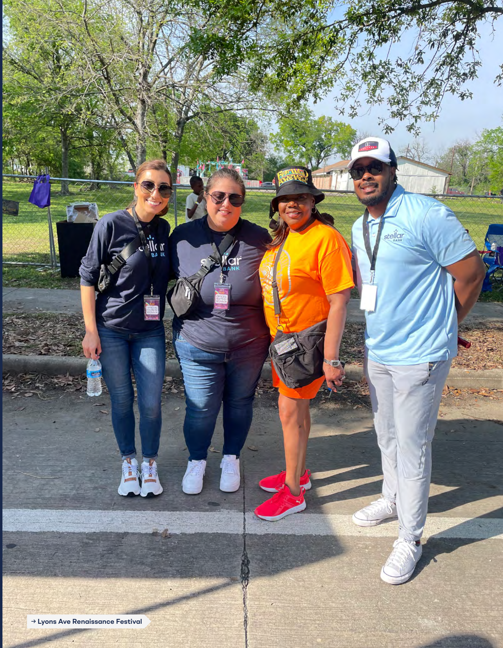
→ Lyons Ave Renaissance Festival