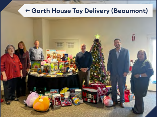
← Garth House Toy Delivery (Beaumont)