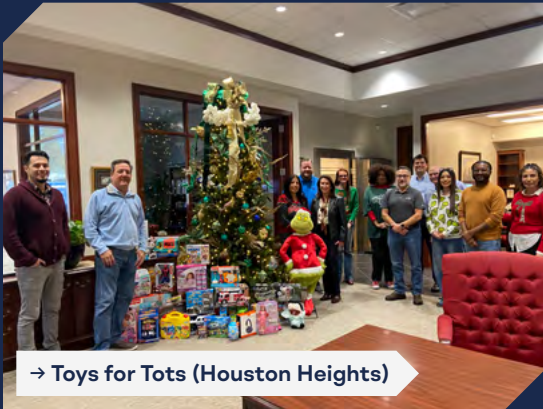
→ Toys for Tots (Houston Heights)