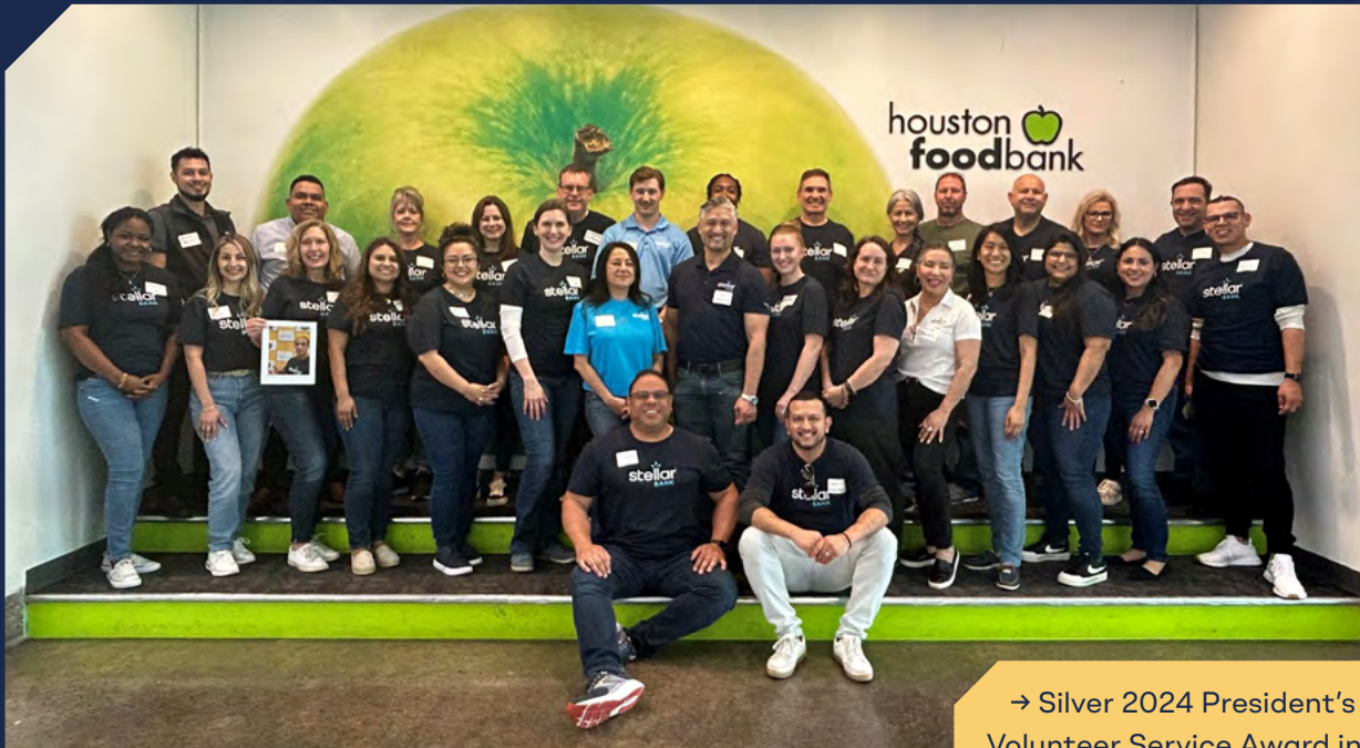
→ Silver 2024 President’s Volunteer Service Award in recognition of our employees’ volunteer time with the Houston Food Bank