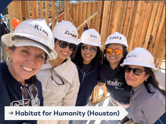
→ Habitat for Humanity (Houston)