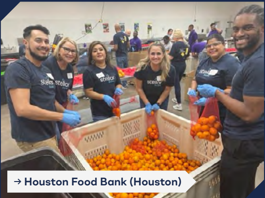
→ Houston Food Bank (Houston)