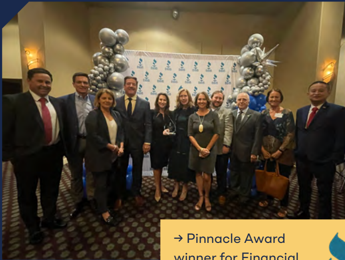
→ Pinnacle Award winner for Financial Services at the Houston 2024 BBB Awards of Excellence