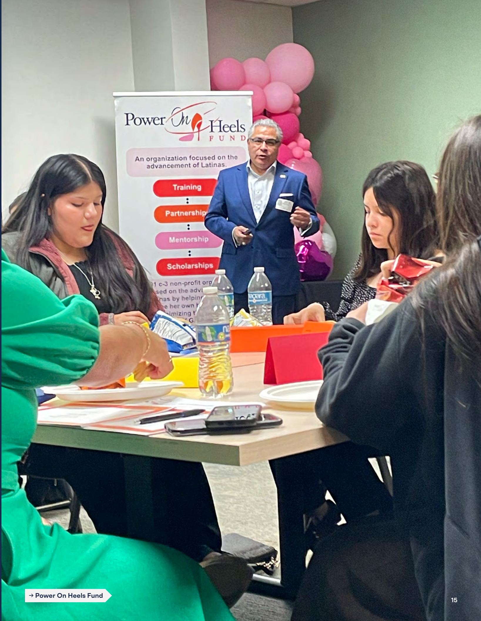
→ Power On Heels Fund