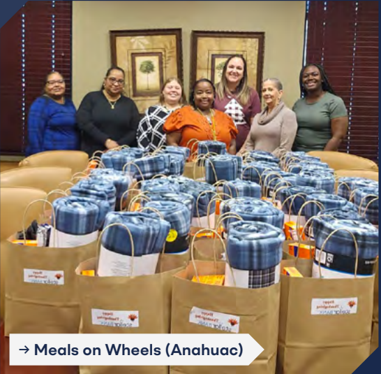
→ Meals on Wheels (Anahuac)

“I am truly grateful to be a part of an organization that does so much to support Houston, Dallas, Beaumont and beyond.”