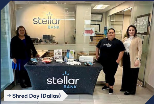
→ Shred Day (Dallas)