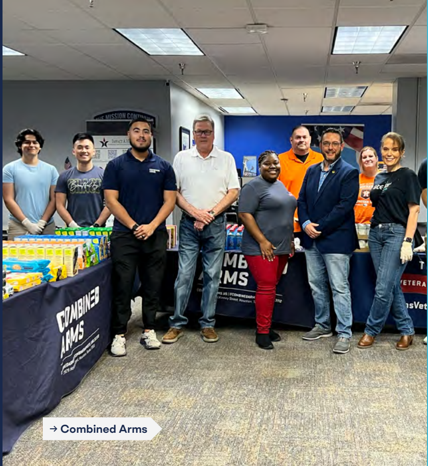
→ Combined Arms