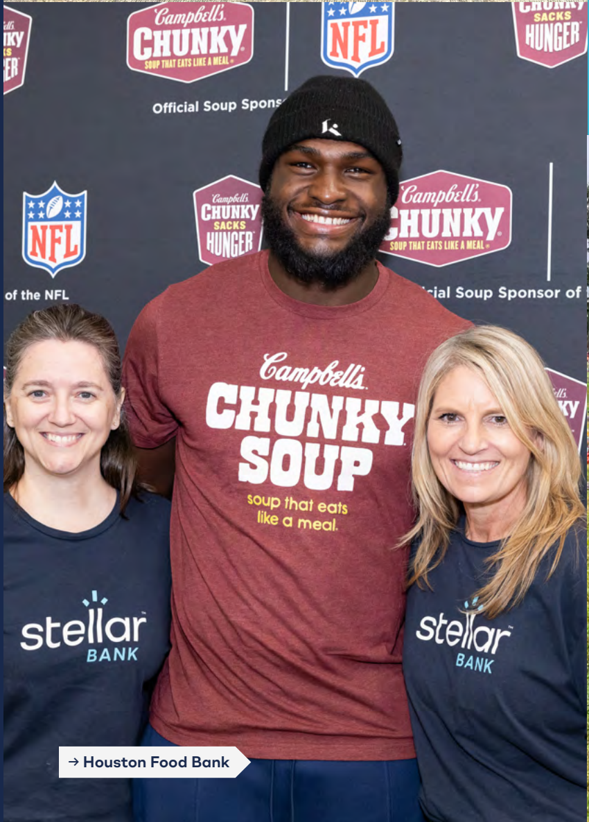
→ Houston Food Bank

Community banks build strong communities, sustaining our local economies for generations to come.