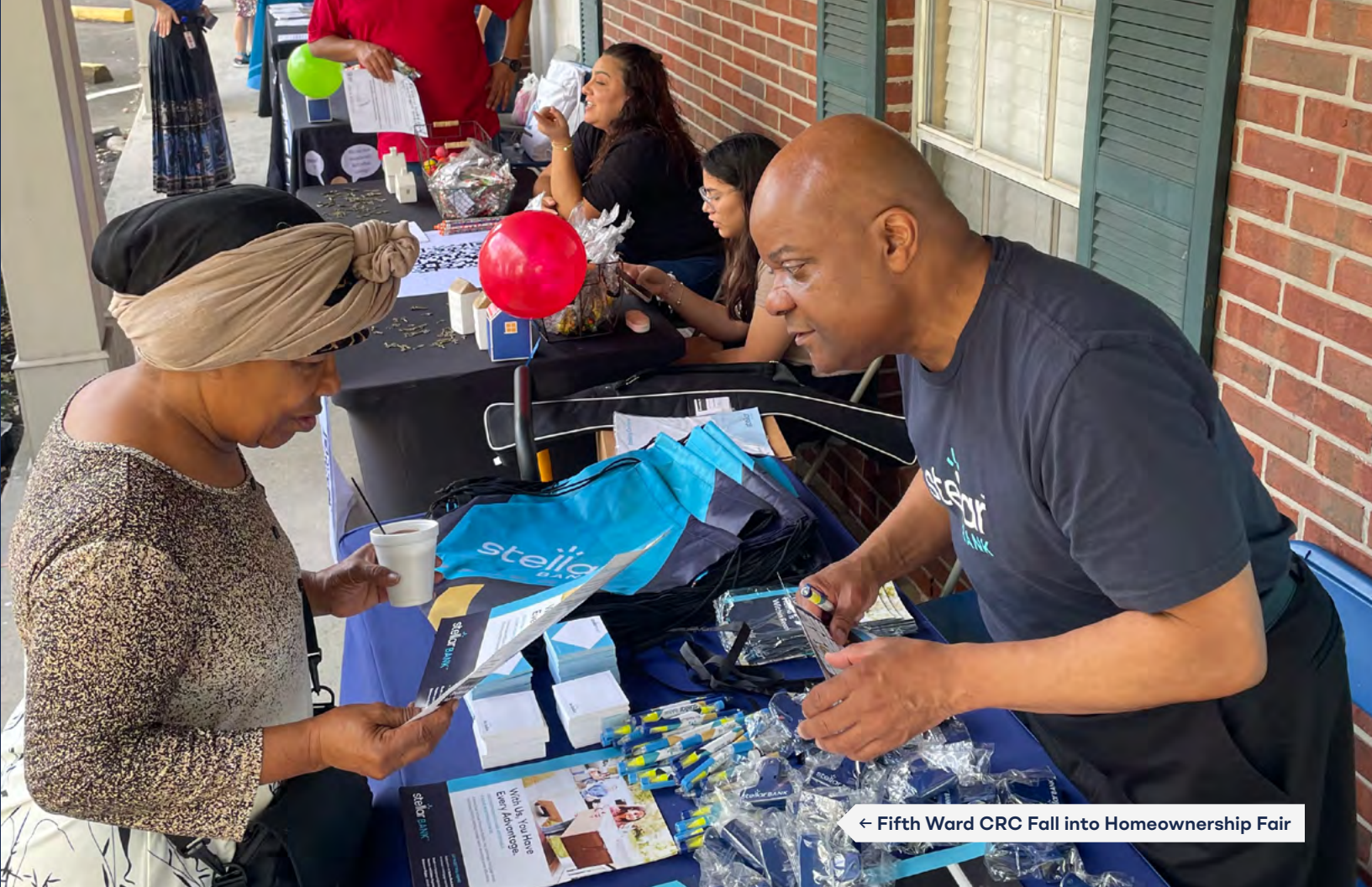
← Fifth Ward CRC Fall into Homeownership Fair